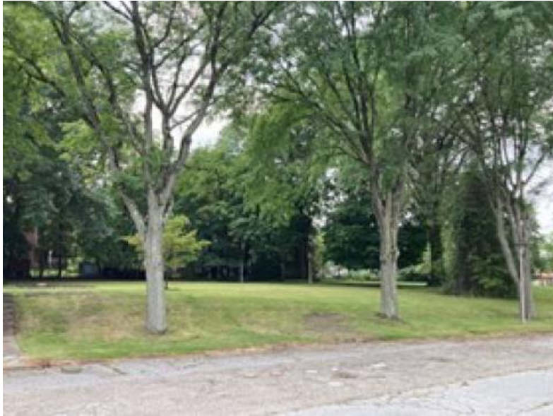
Image three: Adjoining greenspace located to the right of 7228-7930 McPherson Blvd.