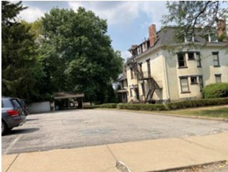
Image two: Paved parking lot located at the rear of 7228-7930 McPherson Blvd