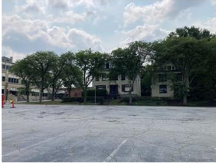
Image one: Paved parking lot located at the front of 7228-7930 McPherson Blvd